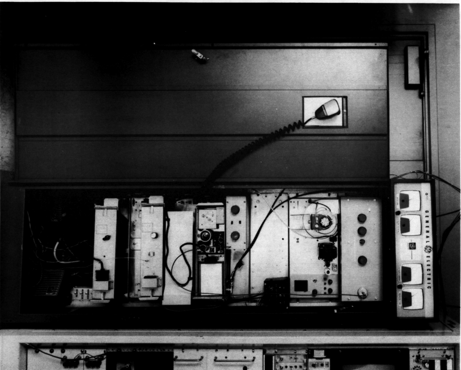
Figure 3.- GE transceiver console.