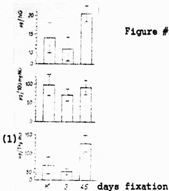
Figure #2. Average levels of catecholamines during adaptation to repeated fixation plus or minus sigma (SD). K - control group. (1) micrograms per 1 kilogram of body weight.

to be statistically significant. The central part of figure 2 shows the concentration of KCHA in 100 mg of NO tissue. It indicates a decrease in the case of animals fixated for 3 days and a return to essentially control group levels in animals fixated for 45 days. However, the results are not statistically significant. The bottom part of figure 2 shows the contents of KCHA in one NO per 1 kg of body weight. In adapted animals the level of adrenal KCHA (P less than 0.001) per 1 kg of body weight was approximately twice that of control animals or that of animals that have not yet become adapted. (Body weights in g: control 207 plus-minus 16; fixated for 3 days 186 plus-minus 14; fixated for 45 days 162 plus-minus 14.)