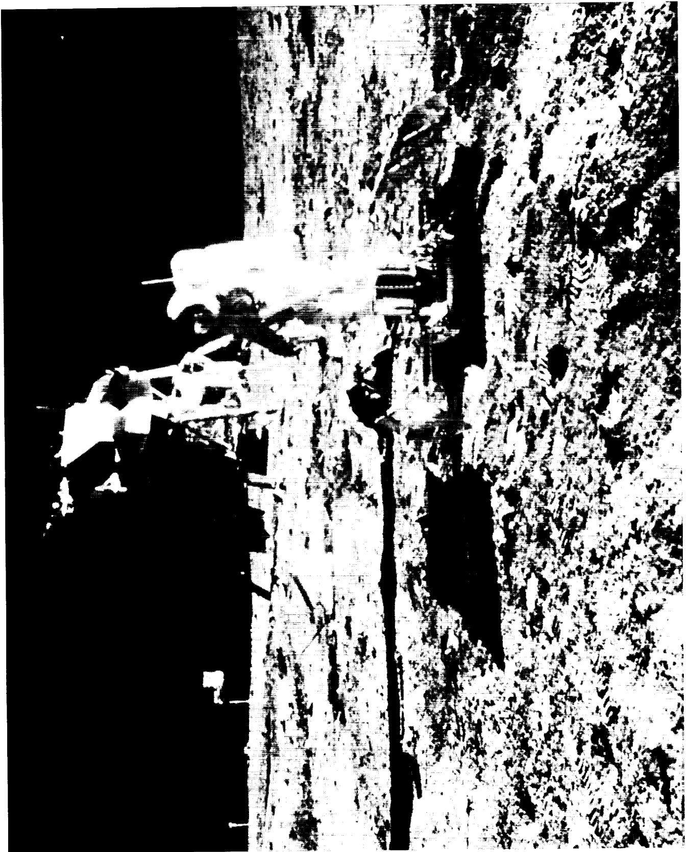
Figure 1 : Deployment of scientific instruments on the Moon. Note the crisp footprints.