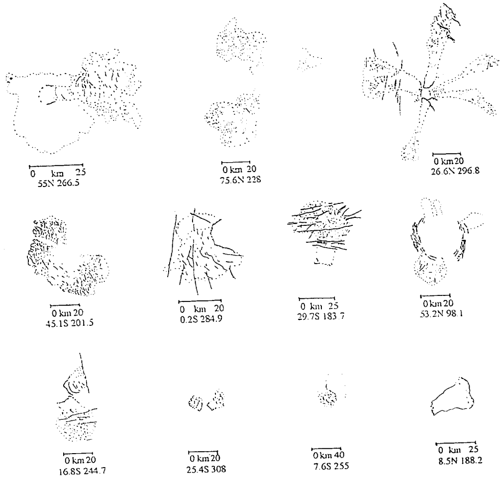
Fig. 1. Mapped outlines of slump and debris avalanche aprons. The outline in the bottom right is that of a possible lava flow from the collapsed margin dome on Sapas Mons.

On Earth, landslides on volcanic edifices can be triggered by a number of different processes, including those occurring as a result of aseismical crustal deformation, such as oversteepening of slopes due to deformation (possibly resulting from dyke emplacement of magma rise), overloading of the slope (by lavas), excess weight at the top of the slope (due to a large cone or a large area of summit lava), removal of support by explosions on the flanks, and caldera collapse. Failure occurring coseismically can result from structural alteration of the constituent parts of the slope leading to failure, dislodgement of otherwise stable slopes, and fault movement resulting in an increased slope angle [4]. Seismic pumping may also be a major control on slope stability during an earthquake [5].