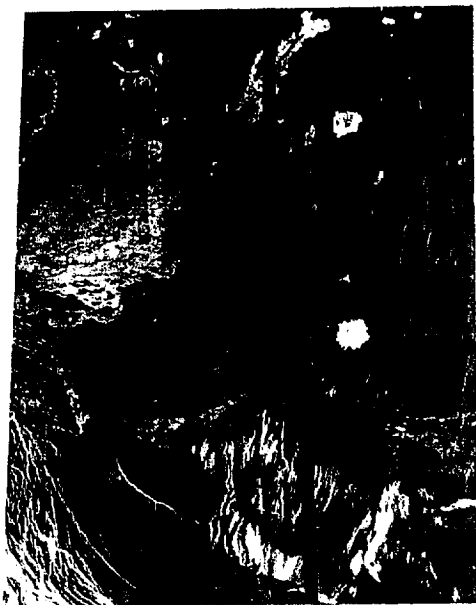
Fig. 1. Crater Annia Faustina, located east of Gula Mons. The crater is 22 km across, and the parabola is 6630 km long and 720 km across. Parabola material from Faustina clearly darkens lava flows from Gula Mons where it appears that centimeters to decimeters of covering ejecta material reduces the radar wavelength scale roughness of the surface.

A reconnaissance survey of 336 craters (about 40% of the total population) was conducted. About half the craters examined were located in and around the Beta-Atla-Themis region, and half were spread over the western hemisphere of the planet. The survey was conducted using primarily C1-MIDR images. The preliminary survey shows (1) Of the 336 craters, 223 were found to have extended ejecta deposits. This proportion is higher than that found in other Venus crater databases by up to a factor of 2 [12]. (2) 53% of all extended ejecta craters were unambiguously superimposed on all volcanic and tectonic units. Figure 1 shows a representative example of this group. Crater Annia Faustina's associated parabolic ejecta deposit is clearly superimposed on volcanic flows coming from Gula Mons to the west (Gula is not shown). Parabola material from Faustina has covered the lava flows, smoothing the surface and reducing its specific backscatter cross section. The stratigraphy implies that the parabola material is the youngest observable unit in the region. (3) 12% of extended ejecta deposits are superimposed by volcanic materials. Figure 2 shows a typical example. Crater Hwangcini has extended ejecta that has been covered by volcanic flows from a dome field to the northwest, implying that the volcanic