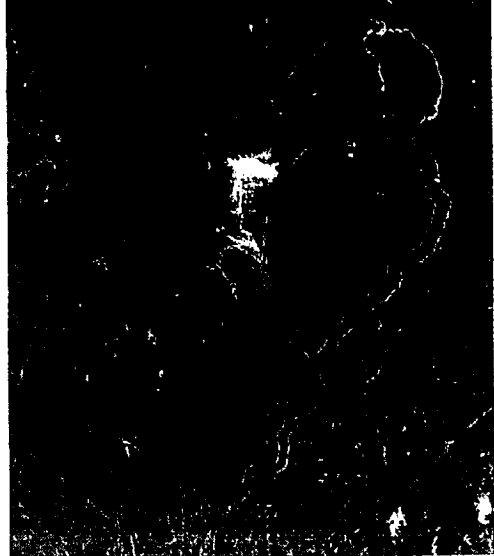
Figs. 1 and 2. Venusian sinuous rilles have morphologies similar to lunar sinuous rilles. The channels have collapsed pits, and shallow and narrow downstream. These morphologies indicate loss of thermal erosion capacity as the lava cools.