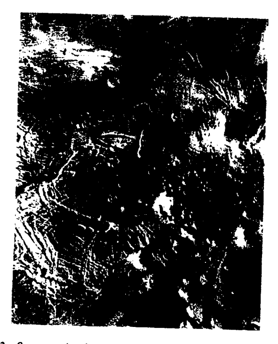
Fig. 3. Some venusian sinuous rilles are associated with coronae. Corona volcanism may have provided required conditions for the sinuous rille formation (high discharge, high temperature, low viscosity, etc.).

channels. However, incision was caused by the long flow duration and high temperatures of eruption, along with relatively large discharge rates, possibly assisted by a low viscosity of the channelforming lava. Channel narrowing and levee formation suggest relatively fast cooling. The venusian channels could have had a similar sequence of formation including rapid cooling.