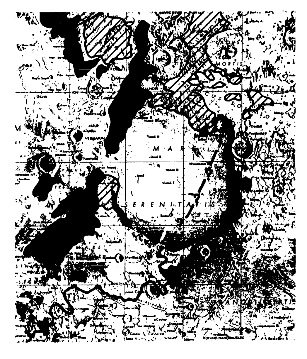
Fig. 2. Influence of the Imbrium Basin event on Serenitatis. Black pattern is Imbrium massifs and Apennine facies, patterned areas is Alpes Formation of Imbrium age. Solid black line represents outer edge of continuous Fra Mauro Formation, the textured ejecta deposit of Imbrium. This line is extended under Mare Serenitatis along an average range from the rim of the Imbrium Basin. From [15].

Post-Serenitatis basin geology. The formation of the adjacent Imbrium Basin had a major effect on the Serenitatis Basin (Fig. 2), primarily due to intersection of the Imbrium ring with the northwest part of the basin and ejecta emplacement across the basin. The outer edge of the Fra Mauro Formation probably extends through central Serenitatis (Fig. 2). If the characteristics of Orientale Basin ejecta can be taken as a guide, then emplacement of ejecta from Imbrium surely heavily modified basin floor topography and caused ponding of the combined ejecta and locally excavated and eroded material in lowlying areas. Estimates of the amount of Imbrium ejecta at the Apollo 17 site based on simple assumptions of radial thickness decay [18] are in the range of 100 m, although the ballistic emplacement of ejecta at