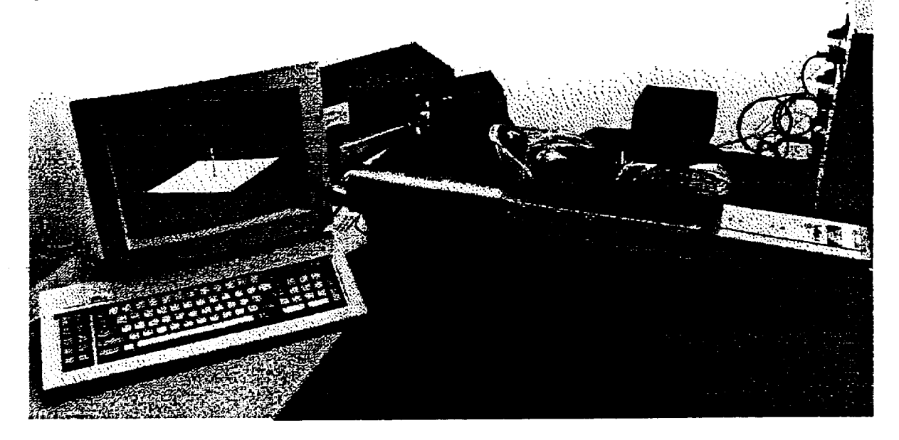
Figure 3. Martin Marietta programmable portable correlator.

The need for optical correlators that are used outside the laboratory has stimulated many advances in optical correlator architectures. The first major advance was the use of a telephoto lens system to shorten the correlator optical path from 4 meters to 1 meter. This resulted in practical implementation of the optical correlators to realistic table-top applications.