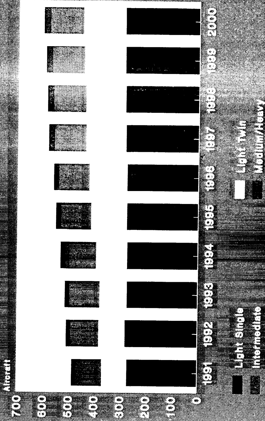
Figure 1. Ten-year civil helicopter forecast: 5,300 aircraft by weight class.