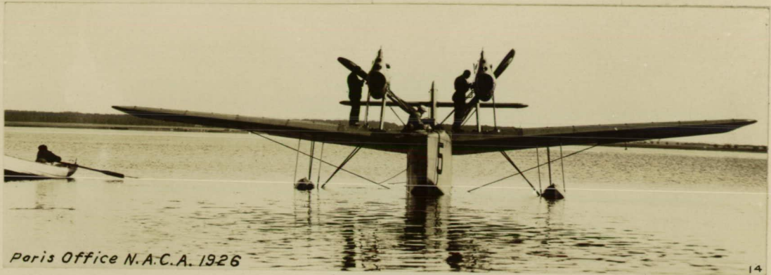
Paris Office N.A.C.A. 1926