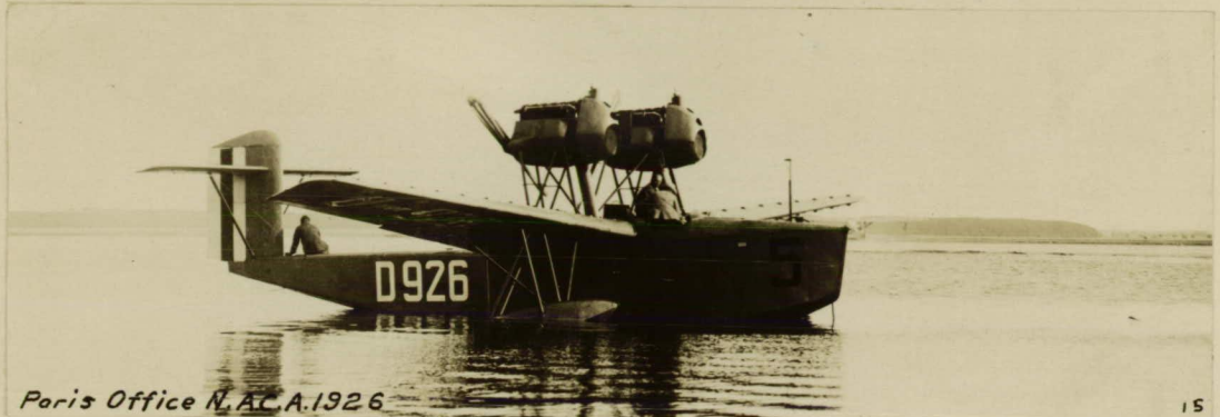
Paris Office N.A.C.A. 1926