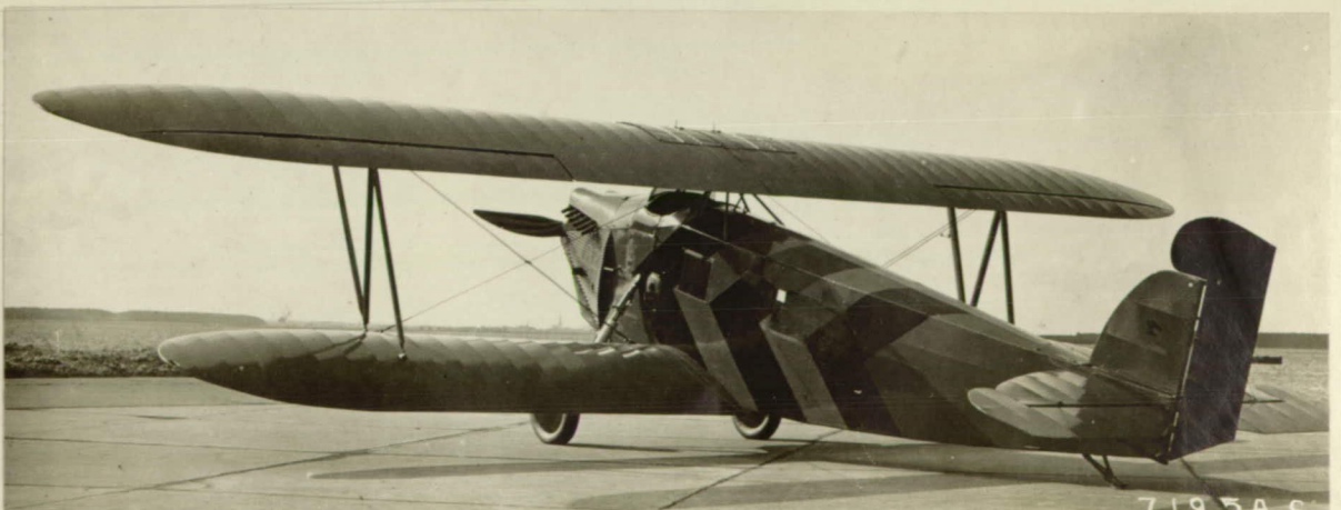
Figs. 2, 3, & 4 The Heinkel H.D.40 commercial airplane