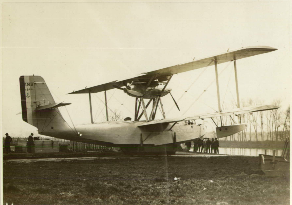
Figs. 2 & 3 Three-quarter views of the C.A.M.S. 54 G.R. seaplane with two 500 HP Hispano-Suiza eng. 6780 A.S.