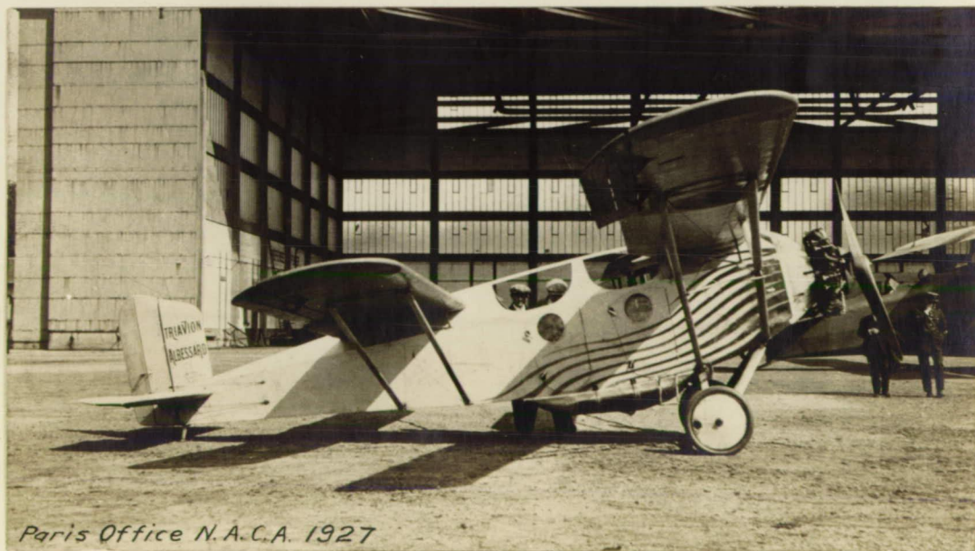
Fig.3 Albessard "Triavion" airplane. (95 HP Salmson engine.)