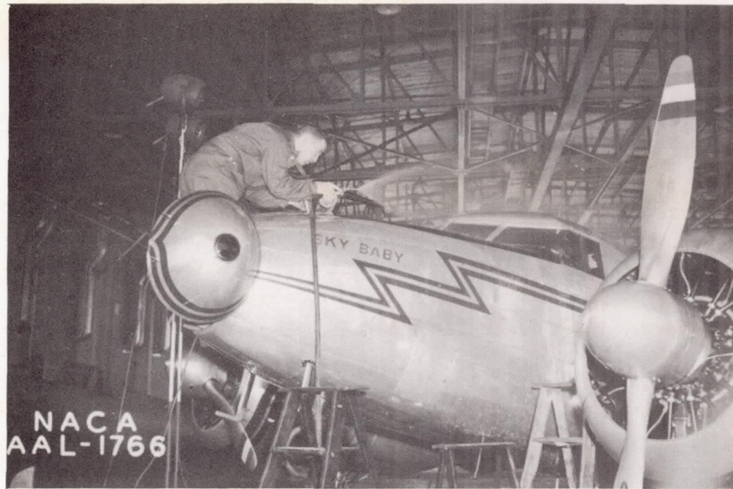
Figure 1.- Lockheed 12A. NC-17397. (Lorr Laboratories). Ground test set-up used to demonstrate rain-repellent application on windshield.