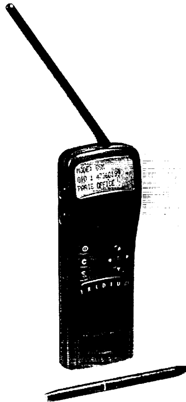
Figure 2. Iridium Handset