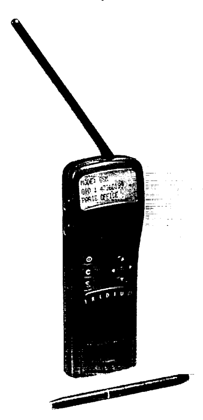
Figure 2. Iridium Handset