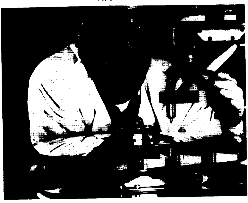
Figure 2. The infrared Keck secondary being measured on LODTM.