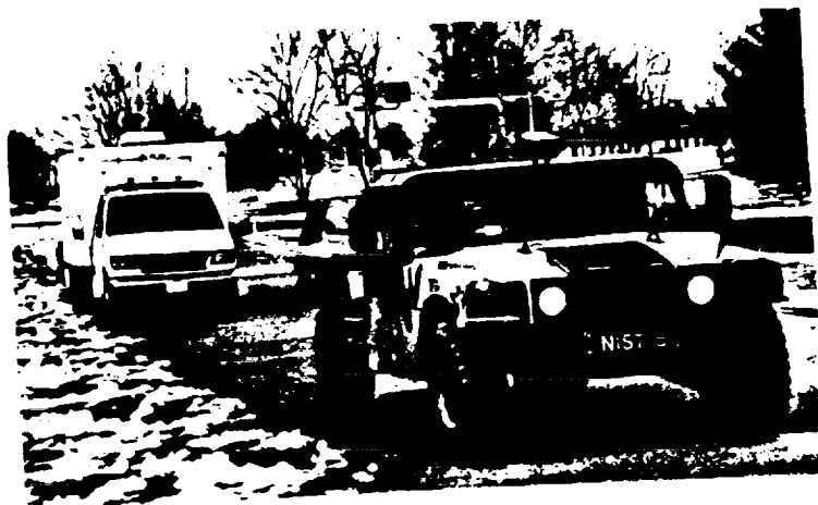
Figure 1. Testbed vehicle followed by support van

The unmanned vehicle, a HMMWV, was actuated by NIST, ARL and the Tooele Army Depot as part of the DOD's Unmanned Ground Vehicles program [1,2]. Figure 1 is a photograph of the testbed vehicle. The vehicle contains electric motors for steering, brake, throttle, transmission, transfer case, and park brake and sensors to monitor the dashboard gauges indicating speed, RPM, and temperature.