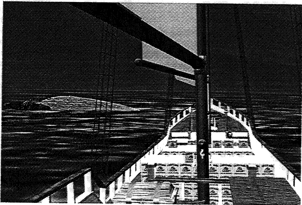
Figure 2. The stowaway and speedboats harass the participant in Virtual Voyage .