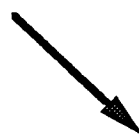
CASSINI OPS CHARACTERISTICS vs. OBSERVATION TYPE