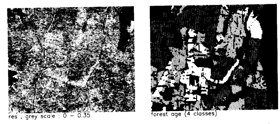
Figure 2. The residual image of a fraction of the Black Forest test site (left) and the age class map (right) of the same area (lighter grey corresponds to older forest).

Figure 1. The water parameter (left) and the residual amplitude (right) over the Freiburg test site ; the brighter areas in the residual image are the forested zones.