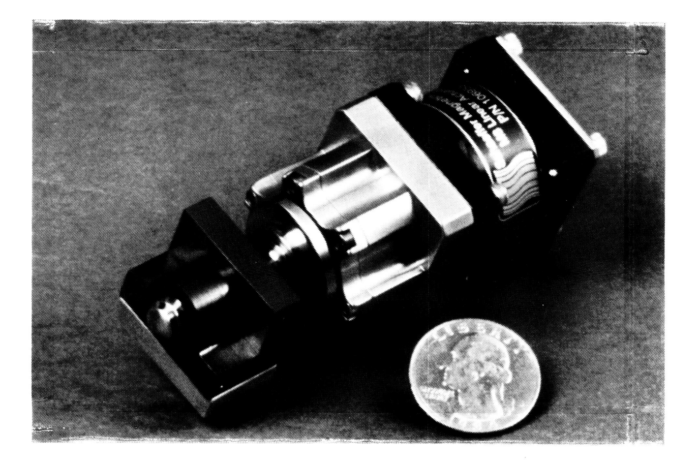
Figure 1. Schaeffer Miniature Incremental Actuator

Development of new products is often hampered or prevented by the cost and resource commitments required by a traditional engineering approach. Schaeffer Magnetics, Inc. identified the potential need for a miniature incremental actuator with an integrated controller but did not want the development to be subject to the obstacles inherent in the traditional approach. In response a new approach - the Pathfinder Engineering Program (PEP) - was developed to streamline new product generation and improve product quality. The actuator/controller system resulting from implementation of this new procedure is an exceptionally compact and self-contained device with many applications.