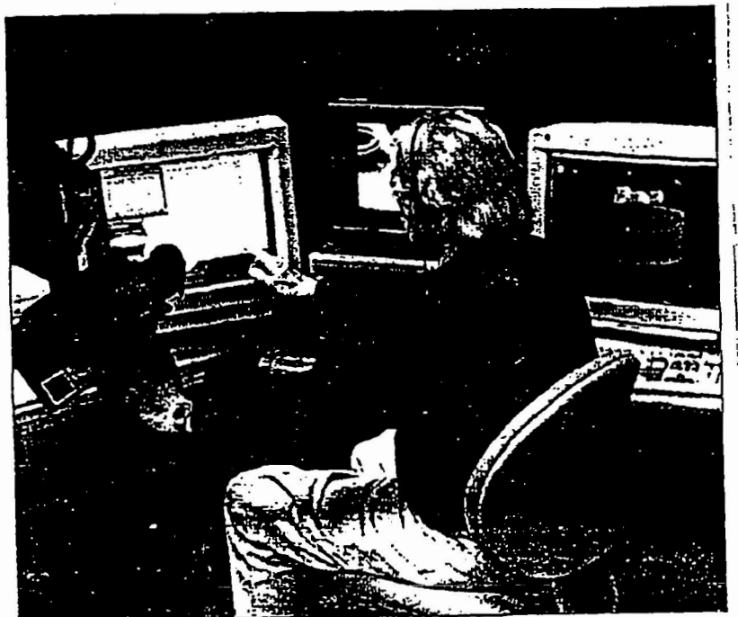
Figure 2: The VR-based multimedia training system.