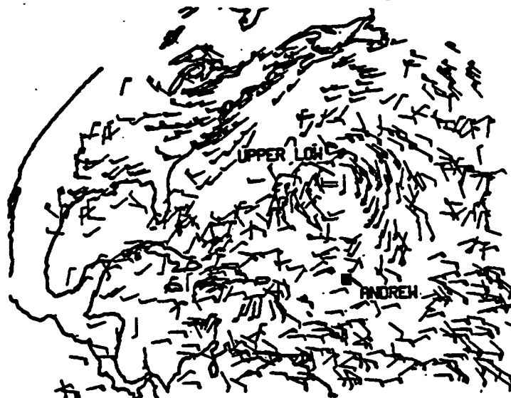
Fig. 1. Typical M-3 water vapor wind set coverage.

The data set presented in Fig. 1 is typical of the data sets produced during the exercise. From a purely qualitative point of view, the horizontal coverage of the water vapor wind vectors shown in Fig. 1 is quite good in comparison to conventional and cloud-drift wind observations routinely available over the western North Atlantic basin. It was found that the vertical distribution of the assigned vector pressure-heights in cloud-free areas (based on brightness temperature to radiosonde temperature comparisons) was typically in the range of 200-500mb, with a peak near 350mb. It was also clearly demonstrated for future considerations that the water vapor wind sets could be created on McIDAS (or VDUC at NMC) in a time scale commensurate with real time operations.