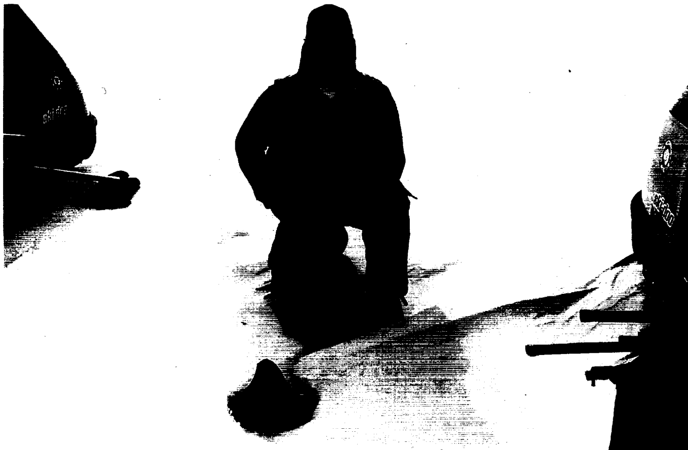
FIGURE 2-3.—The author with the largest meteorite found during the 1984–1985 field season. This meteorite is an ordinary chondrite.

perpendicular to the prevailing wind direction. One line of rocks was placed directly on the ice while the other line of rocks was buried just below the surface of the ice. Both lines were examined during the next year to see how various sized rocks were excavated and moved by the wind. After one year the buried rocks were found to have been entirely exposed by wind ablation of the ice. While the larger rocks had been moved very little, some of the middle-sized rocks had moved downwind by distances in excess of 100 meters. Many of the smaller rocks were never found again.