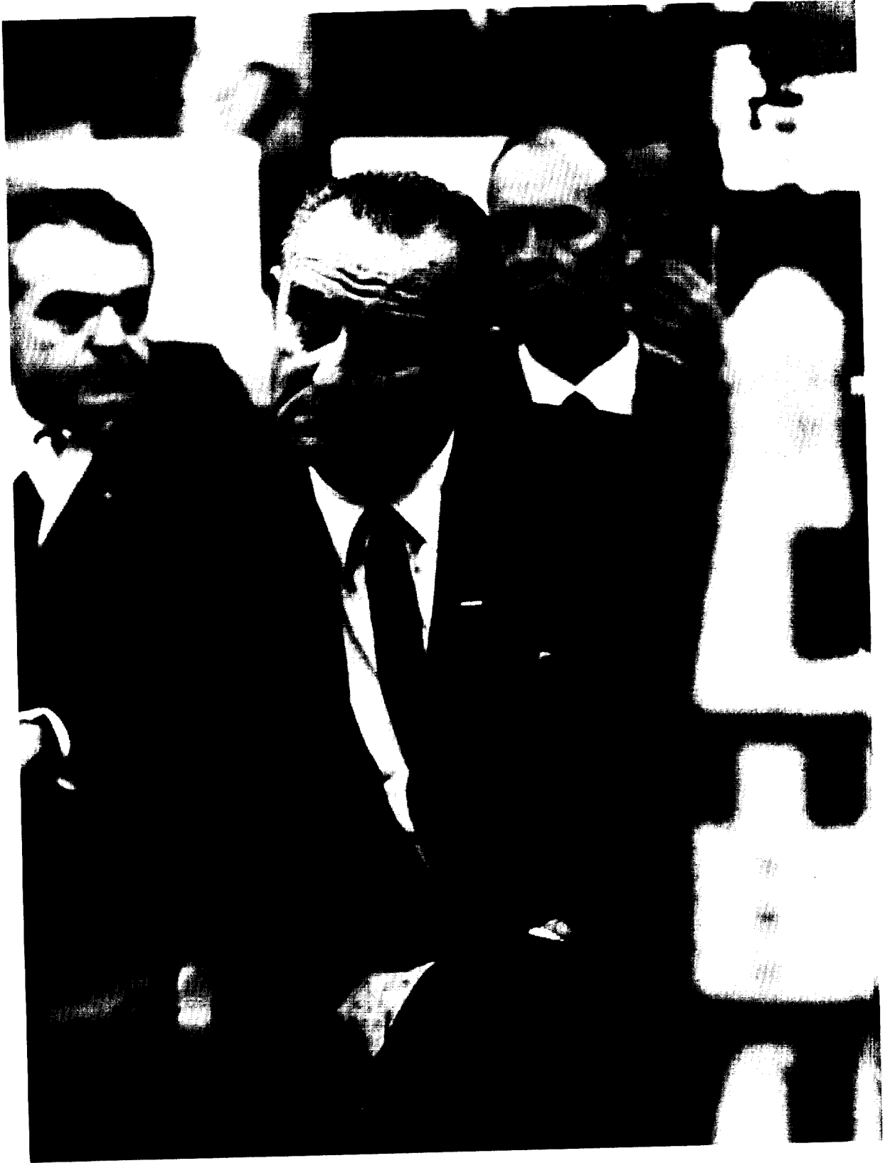
No one understood the importance of the launch of Sputnik for the psyche of the American people more effectively than Senate Majority Leader Lyndon B. Johnson. Here he is shown as president on September 15, 1964, at a meeting hosted by NASA, the agency that he helped to create with the National Aeronautics and Space Act of 1958.