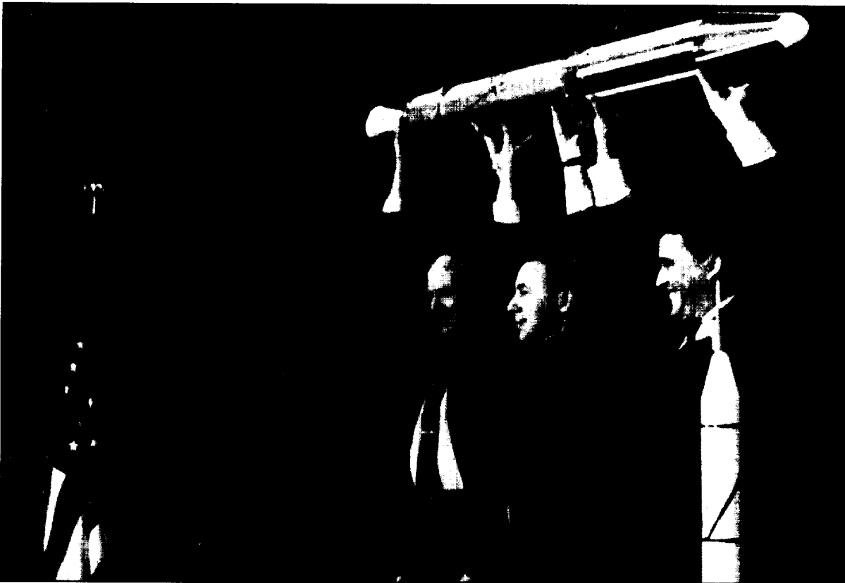
Dr. William H. Pickering, director of the Jet Propulsion Laboratory; astrophysicist Dr. James A. Van Allen, University of Iowa; and Dr. Wernher von Braun, director of the Army's Redstone launch vehicle program, announced on February 1, 1958, at the National Academy of Sciences that they had successfully launched the first U.S. satellite, Explorer 1. This was the signature image that appeared in newspapers around the nation the next morning, but this success also served notice that the nation had to codify the authority for space exploration in a single organization.