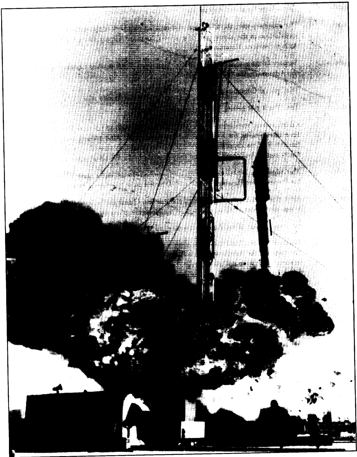
The official American entrant into the scientific satellite effort undertaken as a result of the International Geophysical Year (IGY) in 1957-1958 was Project Vanguard. As an attempt to demonstrate parity with the Soviet Sputnik success, on December 6, 1957, the United States attempted to launch a Vanguard satellite, with spectacular lack of success. A malfunction in the first stage caused the vehicle to explode two seconds after launch. This failure gave added impetus to the legislative effort to create a separate agency dedicated to space exploration.