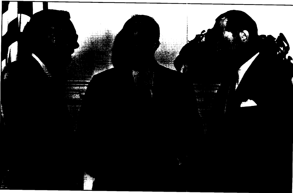
With the passage of the National Aeronautics and Space Act of 1958, and NASA's establishment on October 1, 1958, President Eisenhower appointed T. Keith Glennan (right) as administrator and Hugh L. Dryden (left) as deputy administrator.

ninety minutes or less they just automatically went over national boundary lines. They couldn't do anything about that.