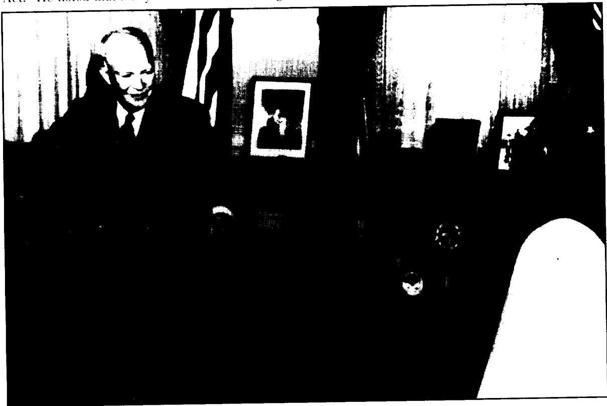
While President Dwight D. Eisenhower had shown an interest in space activities, especially for national defense objectives, prior to the launch of Sputnik 1 on October 4, 1957, he failed to recognize the important psychological affect the launch of the Soviet satellite would have on the American people. Here he is shown in the Oval Office with the recovered nosecone from a Jupiter-C missile carried 1,200 miles downrange on August 7, 1957, before a national television audience.