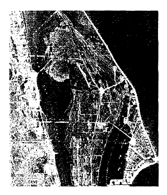
Figure 1: NDVI Image