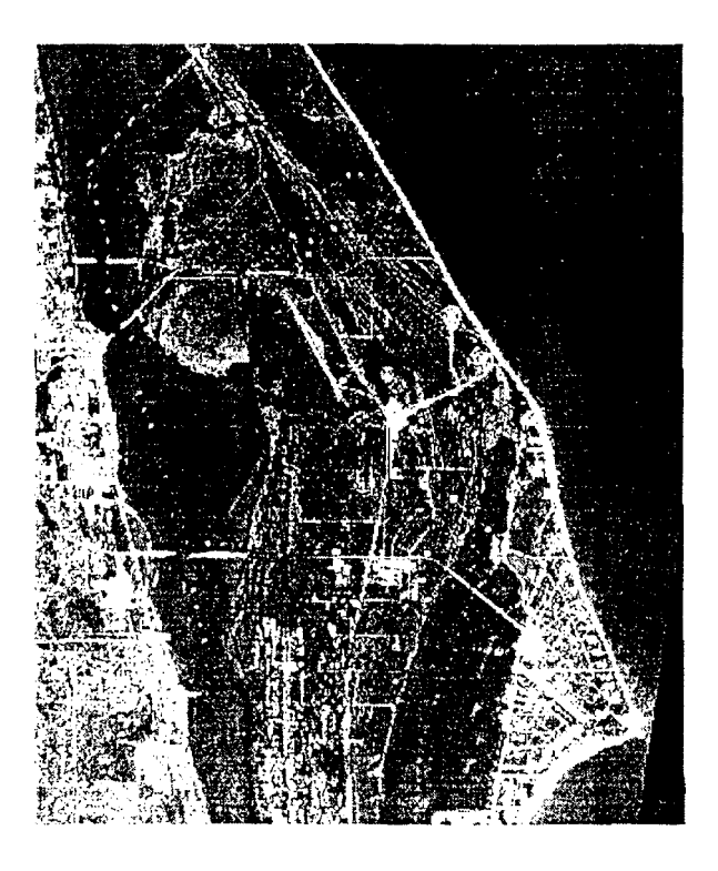
Figure 4: ARVI Image ( \gamma =1.0)