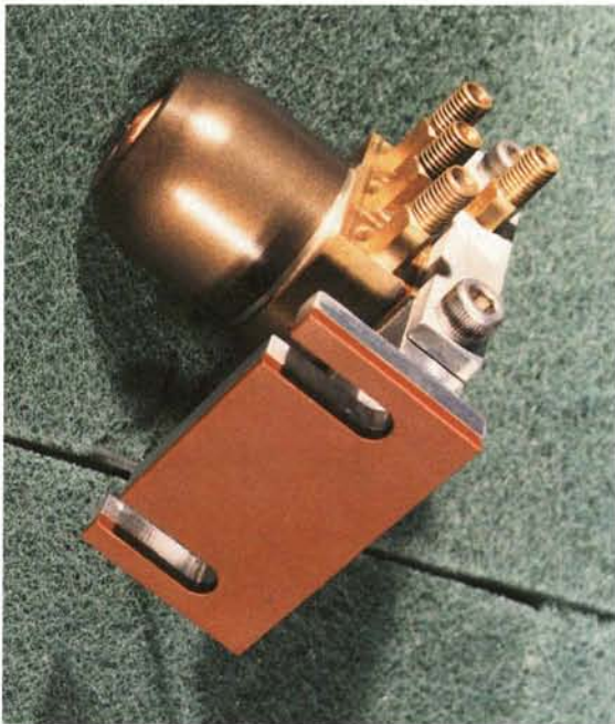
The B&B Precision Machine Variable Polarity Plasma Arc welding torch.

In the late 1970s, when the Space Shuttle was in early development, NASA recognized that the then-existing welding techniques were inadequate for the job of joining the huge aluminum segments of the Space Shuttle External Tank. Accordingly, Marshall Space Flight Center (MSFC) initiated development of Variable Polarity Plasma Arc (VPPA) welding.