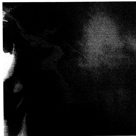
A Landsat image shows the spread of a Persian Gulf oil slick that occurred during the war-caused spill of February 1991. Research Planning, Inc. developed a remotely sensed information system for prioritizing protective measures during oil spills.

As a result of its EOCAP work, RPI is marketing a commercial ESI product that focuses on oil spill response, coastal zone development and environmental assessment using remote sensing and GIS technology. ●