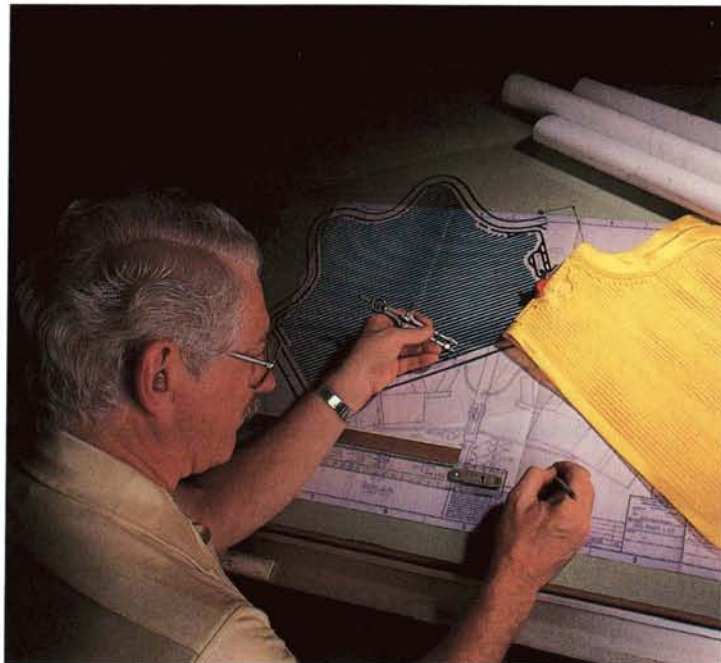
An LSSI engineer is using specifications of an adult-size vest as a basis for designing the scaled-down HED vest.