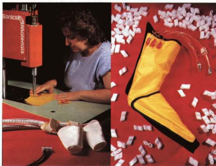
For Toby, LSSI designed a special unit with cooling slippers, shown being fabricated at left; at right is a commercially-available slipper.