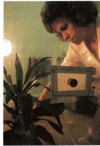
A research assistant is conducting an absorption test; the plant is placed in a sealed chamber into which a gas is injected, then the amount of gas absorbed by the plant is measured. Stennis' Environment Research Laboratory is testing a variety of plants against a wide range of indoor pollutants.

Both Bio-Safe and Applied Indoor Resource Company began marketing their filters in 1988. Both reported good initial public reaction.