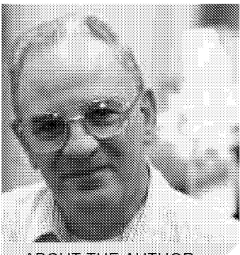
ABOUT THE AUTHOR

Normally, I would have taken a pragmatic approach: "You're on the observatory, your instruments are working, and good enough is good enough." On the other hand, we had more than adequate slack in the schedule, and we were coming in $30 million under budget--amazing, I know. The question then was, what could we do to make the science better? Given that we had the time, given that we had the money, one answer to this question was: better calibration. For those who just do a marginal job of calibration prior to testing, the alternative is to calibrate again in orbit. Calibration in orbit takes a long time to do, and it's not as precise as it is on the ground. So there really was a net benefit to be gained from the science of doing this. If our scientists had the opportunity to tweak and calibrate their instruments on the ground, they would likely get better science in space. In order to provide a proper return on our $100M NASA investment, ACE--an Office of Space Science mission--had to perform on all cylinders, so to speak.