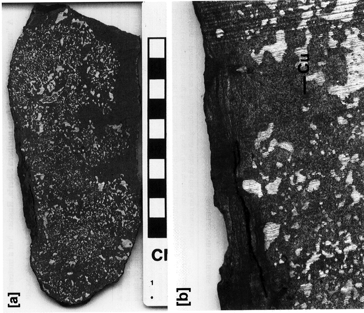
FIG. 1. Putorana Rock: macroscopic. (a) Sawed surface of a slab; scale bar in centimeters, dot at far left is 1 mm in diameter. Light areas in rock are Fe metal and cohenite; dark areas are silicate. Note emulsion-like texture of rounded metallic grains in silicate matrix, and larger basaltic clasts (dark, metal-free). Rusty alteration present only on edges of rock (see far right) and in cracks. (b) Detail of emulsion texture (upper central portion of (a)). Veinlets of fine-grained alteration material (serpentine and chlorite?) at top. Bleb of copper metal (Cu) is the only such grain larger than tenths of a millimeter visible on either side of the slab. Field of view is 2 cm.