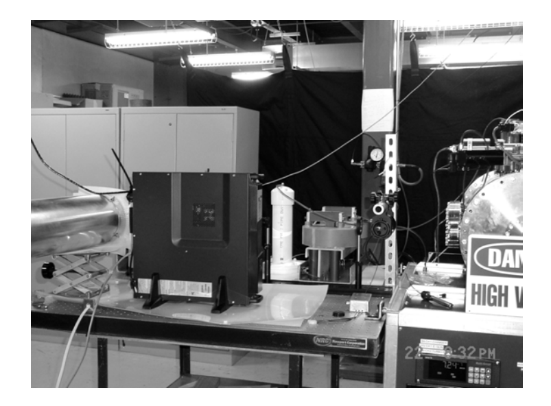
Fig. 1: Experimental apparatus

(partially), identify and de-convolve the Voight profile into the Lorentzian and Gaussian forms, and identify the widths associated with these. Most programs were fairly straightforward. The system resolution removal used standard techniques, based on a detailed optical analysis of the system, to generate a theoretical description of the optical transfer function (OTF) [1]. It was then removed from the data. The last two programs used an algorithm based on the transform of the magnitude of the spectral line. It was shown by closed form analytical development that the Lorentzian and Gaussian forms were separatably related to the slope and curvature of the result. Actual implementation developed some problems caused by the limited sampling capability of the CCD array available in ,conjunction with the dispersion capabilities of the spectrograph. These were overcome by a DSP scheme though they could also be addressed by the use of 2k, 4k or larger linear CCD arrays. The resulting software was verified by processing the output below which originated from a previously characterized and documented lamp and by multiple test runs on software generated lines.