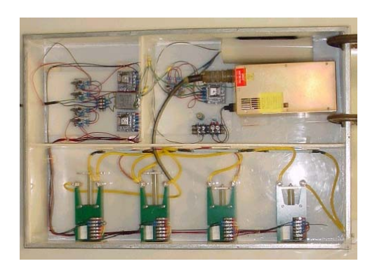
Figure 5: Actual Photo of Chare/Dump Box Actual Size 3x4 Feet