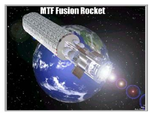
Figure 1: Proposed design for MTF Fusion Rocket