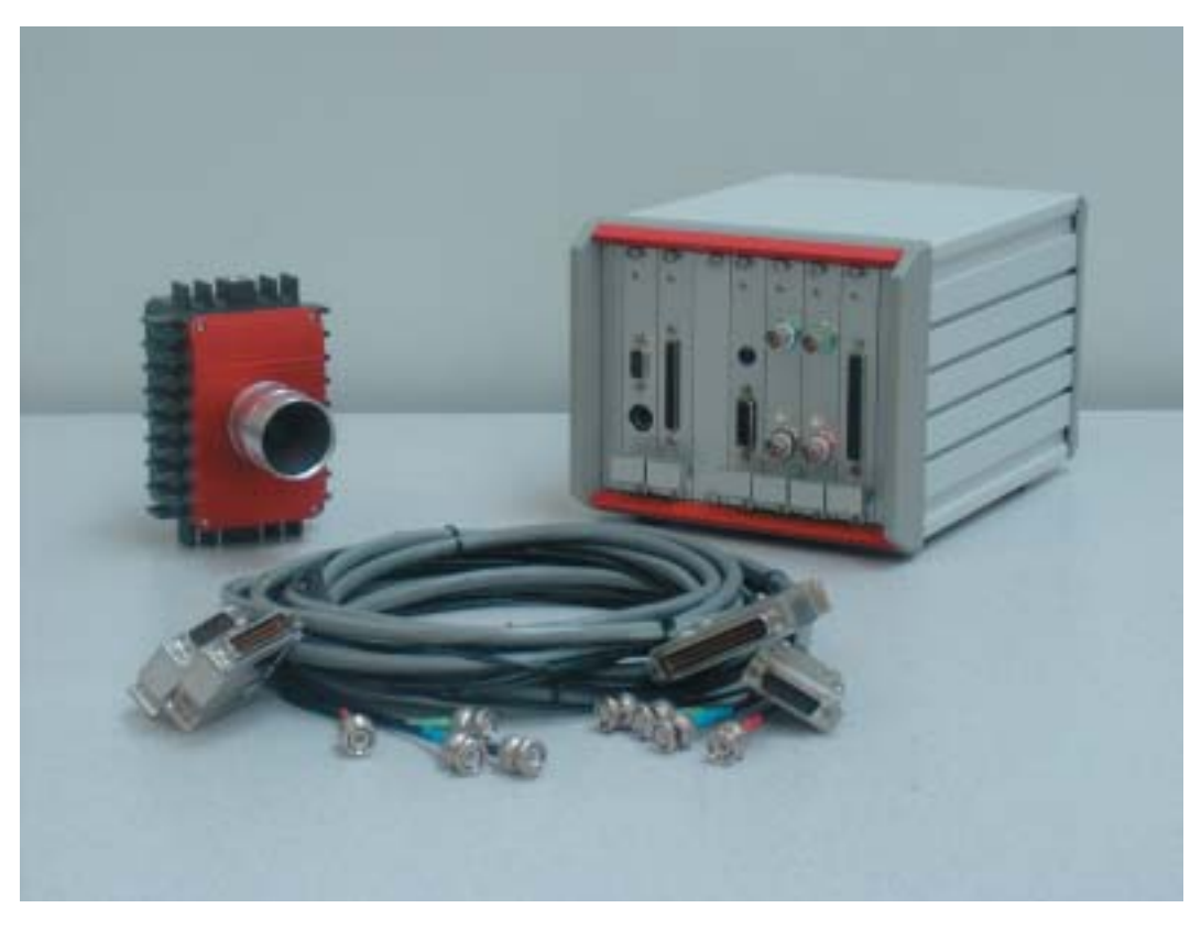
SciMeasure Analytical Systems, Inc.'s "Little Joe" wavefront sensor camera is finding increasing application in astronomy and medicine.

SciMeasure and the Jet Propulsion Laboratory were determined to make the camera design as independent as possible from the most critical components, which turned out to be the CCD itself and the analog-to-digital converters that digitize the analog signals from the CCD. Further camera design projects during Phase I led to considerable progress in versatility and modularity