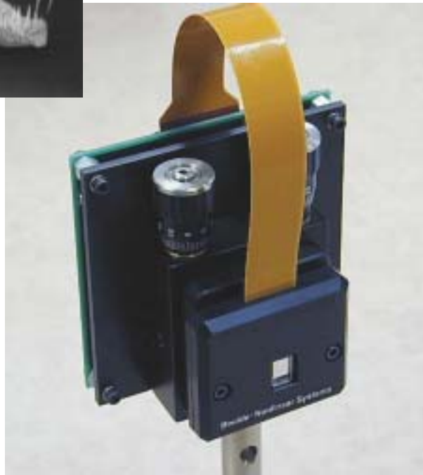
Boulder Nonlinear Systems' liquid crystal Spatial Light Modulators, available in a variety of resolutions, are ideal for optical correlation, beam steering, telecommunications, defense, and medical research applications. The grayscale image of the dragon was taken on a Ferroelectric Liquid Crystal 512x512 Spatial Light Modulator.