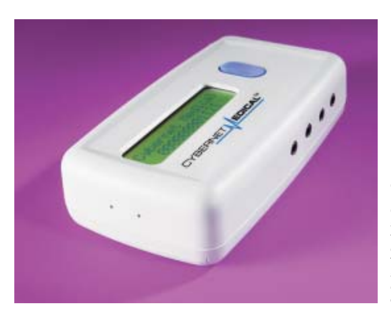
Cybernet Medical's MedStar™ Disease Management Data Collection System is an affordable, widely deployable solution for improving in-home-patient chronic disease management. The system's battery-powered and portable interface device collects physiological data from off-the-shelf instruments.

With statistics showing significant improvements in patient outcomes through closer in-home monitoring, Cybernet saw an opportunity to commercialize the physiological measurement and analysis technology. After completing its SBIR work with Johnson in 1998, Cybernet adapted the technology for its MedStar<sup>TM</sup> Disease Management Data Collection System, an affordable, widely deployable solution for improving in-home-patient chronic disease management. In July 2001, Cybernet Medical announced the general availability of the MedStar interface device and accompanying data collection server, together called the MedStar System.