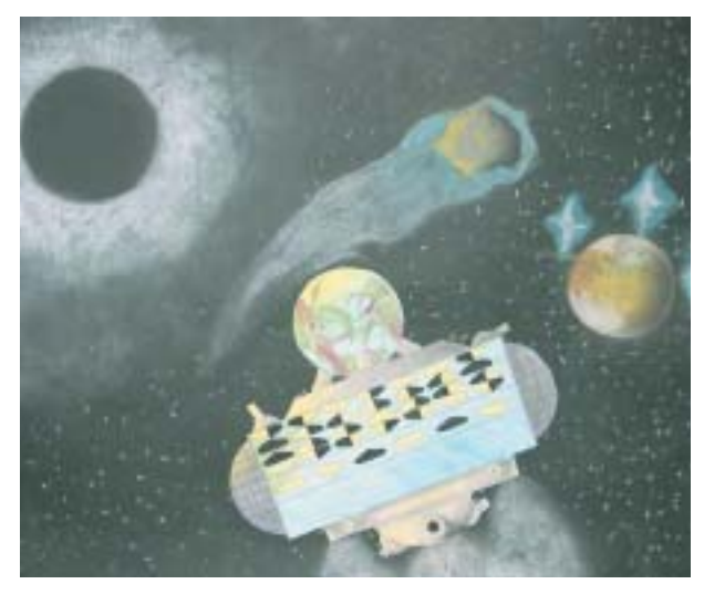
Space Settlement Contest: Design submitted by students from Kadena Middle School in Okinawa, Japan (2002).

Centennial of Flight Celebration, offered student teams awards worth $59,000. Boonsboro High School of Boonsboro, Maryland, placed first in the contest. The top 10 teams became eligible to submit proposals to participate in the 2004 Student Launch Initiative at Marshall Space Flight Center, where students build reusable launch vehicles carrying a science experiment payload up to an altitude of 1 mile.