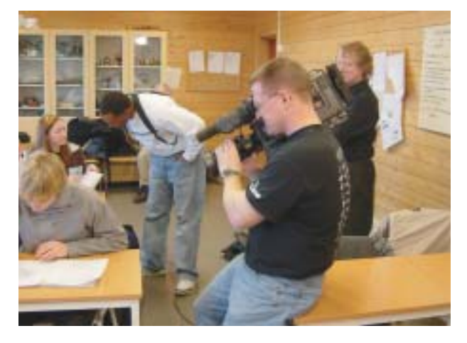
The NASA Connect team visited students at Andoya High School in Andenes, Norway, to tape an instructional video as part of its annual series of free standards-based learning programs.

In March, students from grades 5 through 12 explored the frozen landscapes of Colorado's Rocky Mountains from their desks. As virtual participants in two live Webcasts, students nationwide joined scientists from NASA, the National Oceanic and Atmospheric Administration (NOAA), other Federal agencies, and many universities as they studied the role of snow-cover on the Earth's water and climate. Using skis, snowmobiles, aircraft, and satellites, scientists participating in the 2003 NASA-NOAA Cold Land Processes Experiment studied snowpack from the ground, air, and space across the winter and spring of this year to improve forecasts of springtime water supply and snowmelt floods. Through interaction, students gained an understanding of how remote sensing is used in Earth science research and how