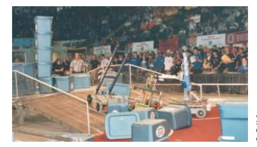
At the 2003 For Inspiration and Recognition of Science and Technology (FIRST) Robotics Competition, students participated in a game called "Stack Attack."

In another region, students gathered at Houston, Texas' Reliant Park for the FIRST Robotics Lone Star Competition. They too, participated in a game of Stack Attack to determine the best functioning robots. The winners of the Cleveland and the Houston competitions sponsored by Glenn Research Center and Johnson Research Center, respectively, in cooperation with local corporations, educational institutions, and organizations—and 21 other regional U.S. contests competed in the FIRST Robotics Championship Competition in May. On a whole, NASA and its Robotic Education Project sponsored 207 of the nearly 800 teams entered in the 2003 FIRST competition. Regional and national awards were presented to students for excellence in design,