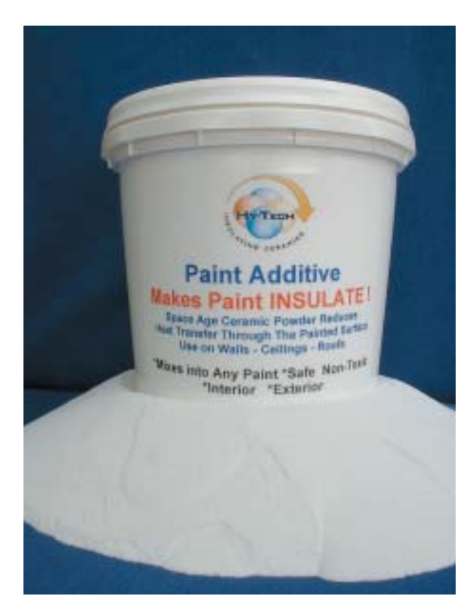
The insulating additive is available as a stand-alone product that can be mixed into store-bought paints, or as a pre-mixed application in a complete line of factory-blended interior, exterior, waterproofing, and roof coatings.

For example, the insulating properties of Space Shuttle tiles immediately came to mind and sparked Abruzzese's interest. He and a coworker asked themselves if it would be possible to incorporate the heatresistant properties of the ceramic tiles into a commercially available paint product, hence reduce the thermal transfer of treated surfaces. The challenge was manysided, but Abruzzese discovered that NASA resources, including the use of NASA and university laboratories, were readily available to permit him to conduct extensive research. He soon began to realize the viability of his idea, and pushed forward to overcome the obstacle of finding just the right combination of materials that would provide adequate coverage, would not be too heavy or delicate, could be sprayed, and would not have an adverse reaction with the paint itself.