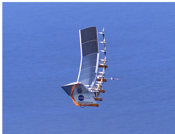
Fig. 1b. Side view of Helios in-flight, left to right, August 13, 2001.