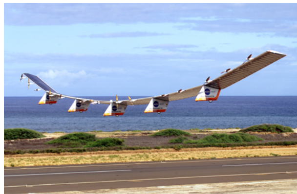
Fig. 1a. Front view of Helios on takeoff for altitude record flight August 13, 2001.

airplane. This configuration increased the airplane gross weight from 1500 lb to 2300 lb. This weight addition was primarily in three point masses; the fuel cell at the airplane center span and hydrogen tanks mounted outboard near each wing tip. Highlights of these flights at Kauai, including the peak altitudes and flight durations are listed in Table 1. A low-altitude mishap on the second flight, June 26, 2003, led to loss of the aircraft. The Pathfinder Plus continues in use for a series of development flight tests at Edwards this year (2004).