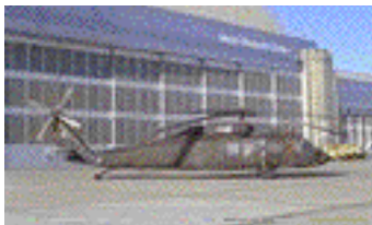
Figure 1: Sikorsky UH-60 helicopter

The Sikorsky UH-60 Black Hawk, shown in Figure 1, is the primary troop transport in the U.S. Army. Variants of the UH-60 are used by the U.S. Air Force (Pave Hawk), U.S. Navy and Coast Guard (Seahawk), rescue and firefighting organizations (Firehawk), and international customers. The Black Hawk is designed for crew survivability and its engines, rotors, and transmission are highly capable of taking damage. Either of its twin turbine engines can keep the helicopter airborne if the other fails, the flight controls are ballistically hardened, the fuel system is crash resistant and self-sealing, and it has widely-separated redundant electronic and hydraulic systems. In this work, we focus on the hydraulic system.