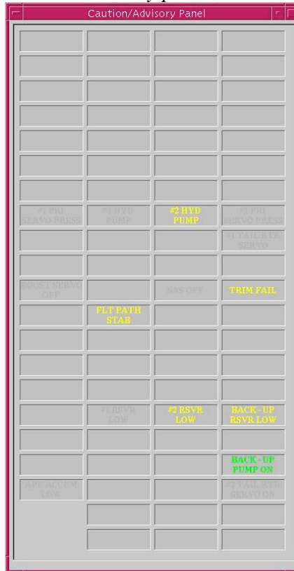
Figure 2: Caution/Advisory Panel showing end-state for leak in the #2 primary servos.

Two related mechanisms assist the Blackhawk pilot in determining the status of the hydraulic system: the leak detection and isolation (LDI) subsystem assists pilots in determining the location of a fluid leakage, and pressure and level sensors inform the pilot of other types of failures. Each anomalous condition results in one or more advisories appearing on the caution and advisory panel , shown in Figure 2.