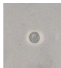
Fig.2. Iron/EPS cast (no Chl “a” fluorescence was observed) preserved after “ C. siderophila ” cells death. Same conditions as Fig. 1.