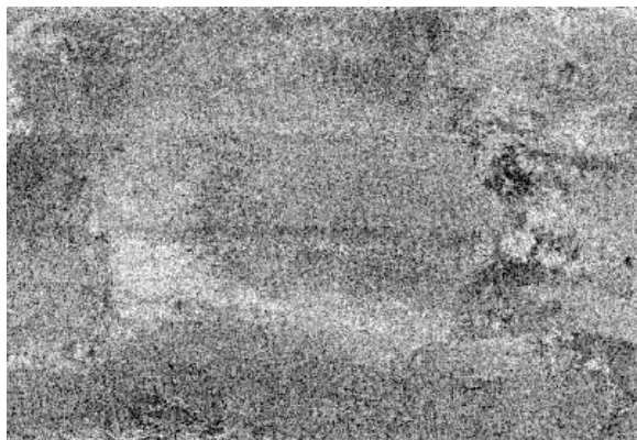
Fig.3. A double ring impact basin?