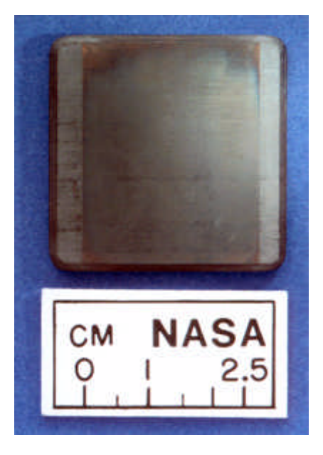
Hybrid composite coupon of MoSi<sub>2</sub>/Si<sub>3</sub>N<sub>4</sub> particulate/Hi-Nicalon SiC fiber after engine testing at Pratt & Whitney.

These and other results led to the decision to test the hybrid composite in the aggressive environment of a gas turbine engine. Test coupons were fabricated and tested in Pratt & Whitney's IHPTET XTC/66 demonstrator engine to simulate the thermal cycling conditions of a blade outer air seal. The composite was exposed to thermal cycles to 1200 °C, with a 600 °C gradient through the thickness of the coupon. It survived all 15 engine cycles without any appearance of distress (see the photomicrograph).