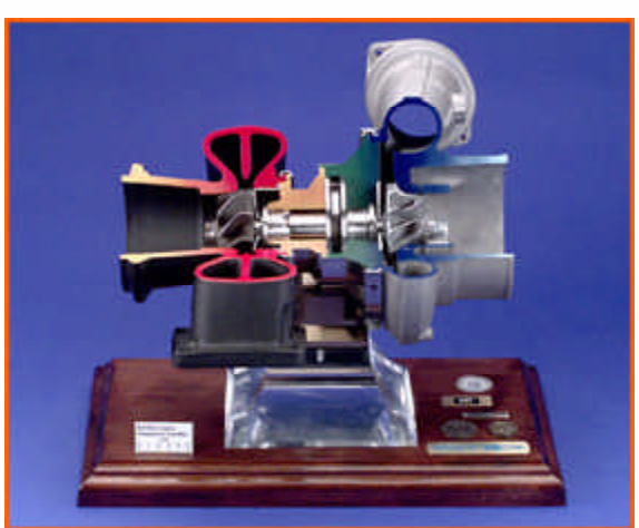
PS304-coated bearing after 100 000 cycles at 1000 °F. This oil-free turbocharger features two journal foil bearings, two thrust foil bearings, a NASA PS304 coating, and a rigid rotor. All dimensions are in inches.

This type of bearing performance suggests virtually unlimited life for foil-bearing-supported, oil-free turbomachinery. By adapting these technologies, future aeropropulsion engines can run more efficiently and be maintenance free as well as oil free.