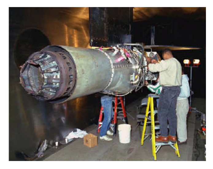
Back end of installation showing the nozzle leaves of the J85 Engine.

conducted over a range of supersonic Mach numbers as well as at some subsonic flow conditions.