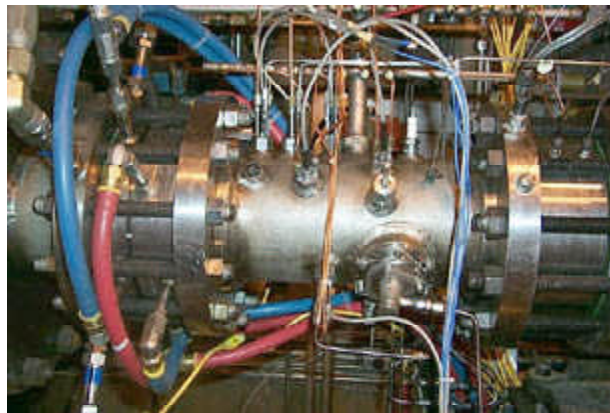
Experimental combustor for stability and active control experiments.

The NASA Glenn Research Center at Lewis Field is leading the Combustion Instability Control program to investigate methods for actively suppressing combustion instabilities. Under this program, a single-nozzle, liquid-fueled research combustor rig was designed, fabricated, and tested (see the photo). The rig has many of the complexities of a real engine combustor, including an actual fuel nozzle and swirler, dilution cooling, and an effusion-cooled liner.