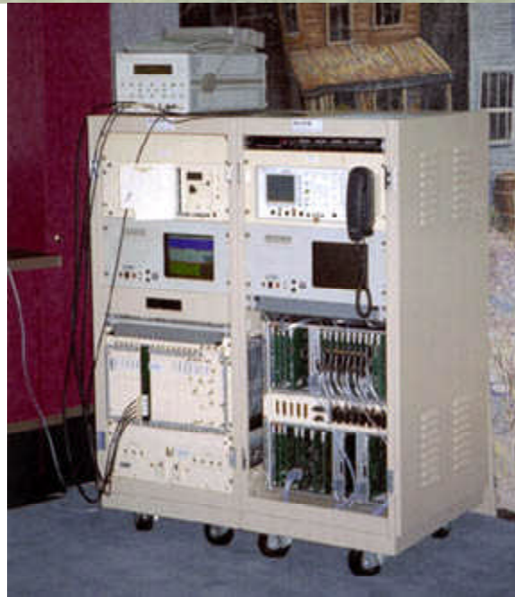
High Speed VSAT. Left: Outdoor unit. Right: Indoor unit.

Development of the high-speed port involved the replication of the T1 VSAT circuit buffer cards, whose primary function is buffering data between the modem bus and the serial port connection. It also involved the definition of a high-speed port address in the address space, and implementation of the custom T1 VSAT address and data bus interfaces on the board. Initial experiments used a prototype high-speed interface; an improved high-speed interface has been developed to support further experimentation.