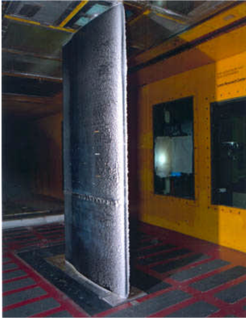
General aviation airfoil with ice accreted in the Icing Research Tunnel.

To further investigate the ways that ice shapes affect the aerodynamic performance of modern airfoils, Glenn's Icing Branch conducted tests in the Low Turbulence Pressure Tunnel (LTPT) at the NASA Langley Research Center. This wind tunnel's unique airflow characteristics allow aerodynamic performance measurements to be made over a wide range of operating conditions. Important scaling factors can be varied so that the aerodynamic performance is accurately simulated for larger airfoils, such as those used on full-scale aircraft. Castings of the ice shapes were made from selected molds. These castings were attached to the airfoil in the LTPT so that aerodynamic performance measurements could be made. The graph gives an example of the results of these tests.